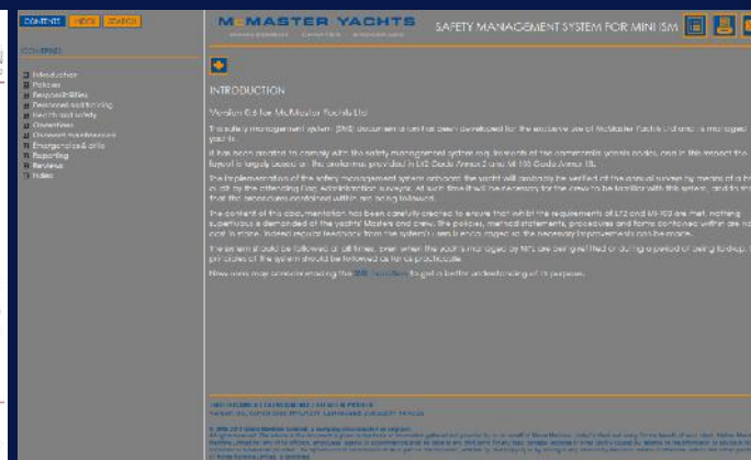
Custom format (management company)